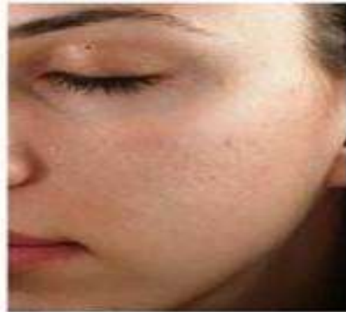
Post 4 Treatment